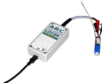
ARC Tag Reader